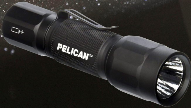
PROGEAR™ TACTICAL 2350 POCKET-SIZED FLASHLIGHT ($ 32.50)