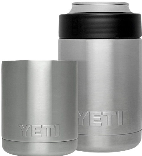
YETI LOWBALL ( $ 21.00 )

These stainless steel, vacuum insulated Ramblers will keep your beverage as cold as science allows.