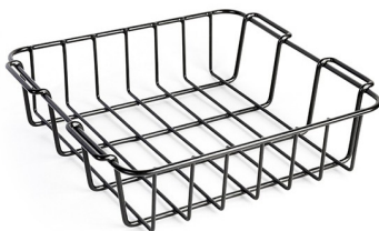
Yeti Tundra Accessories Available Upon Request