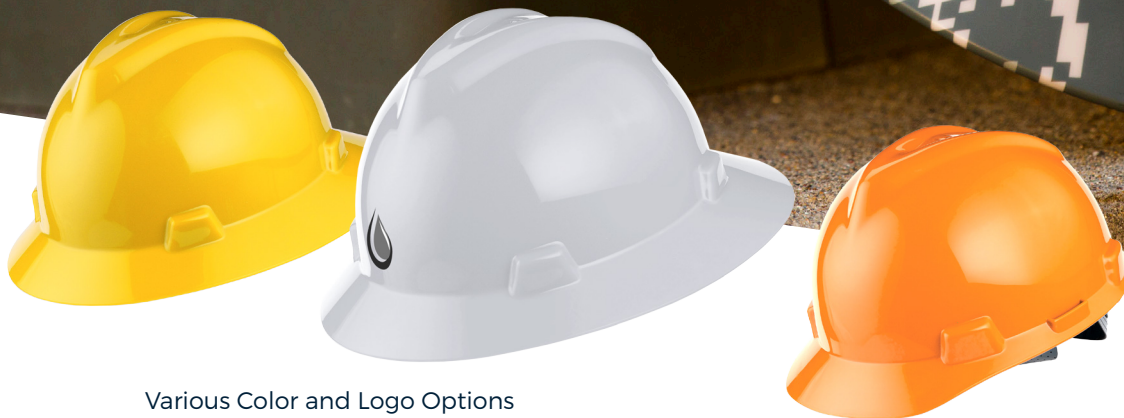
Various Color and Logo Options Available Upon Request