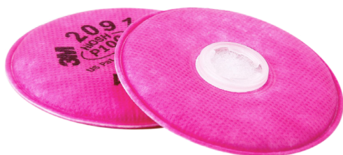
3M PARTICULATE FILTERS COMPATIBLE WITH MASK ($ 7.50)