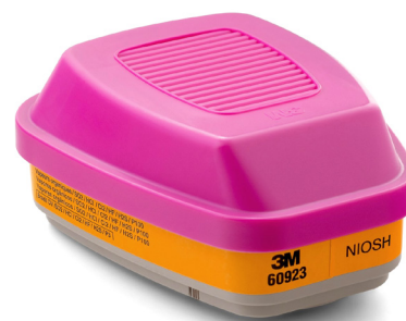
3M ORGANIC VAPOR CARTRIDGE COMPATIBLE WITH MASK 2 Pk. ($ 25.50)